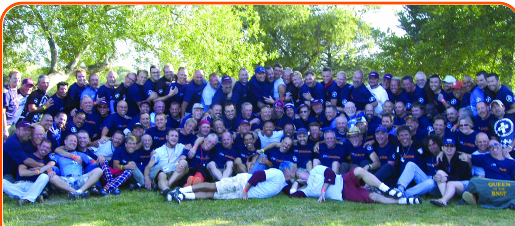
Positive Pedalers on AIDS/LifeCycle 6 on Day 5 in Lompoc.